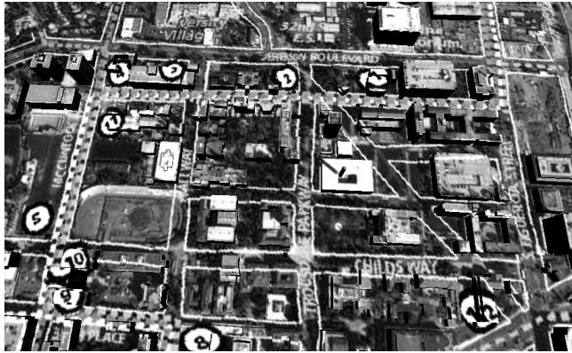
Figure 3: Conflated USC tram route map fused with 3D model is conflated with the aerial imagery and overlaid on the 3D model.