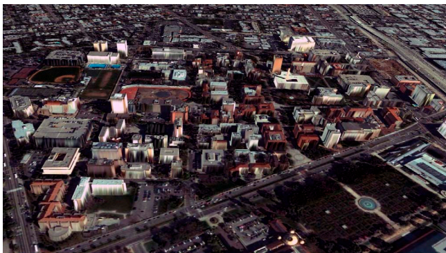
Figure 2: 3D Model Construction

The method consists of first approximating a complex building by a rectangular seed building. After each click, indicating the approximate position of a corner, the system finds nearby corners constructed from extracted line segments. This information is sufficient to construct a 3D model by combining information from the multiple views automatically. The user can then adjust the model height or sides using efficient editing tools.