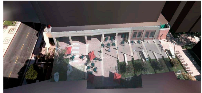
Figure 4: Video Stream Fusion with 3D Model

Static textures are captured by still or video images. The acquisition method and texture mapping process employs a base texture buffer and image warping transformations. Dynamic textures are captured as live video streams. We dynamically fuse video textures from network cameras on a 3D model to reveal the spatial and temporal relationships between the video streams.